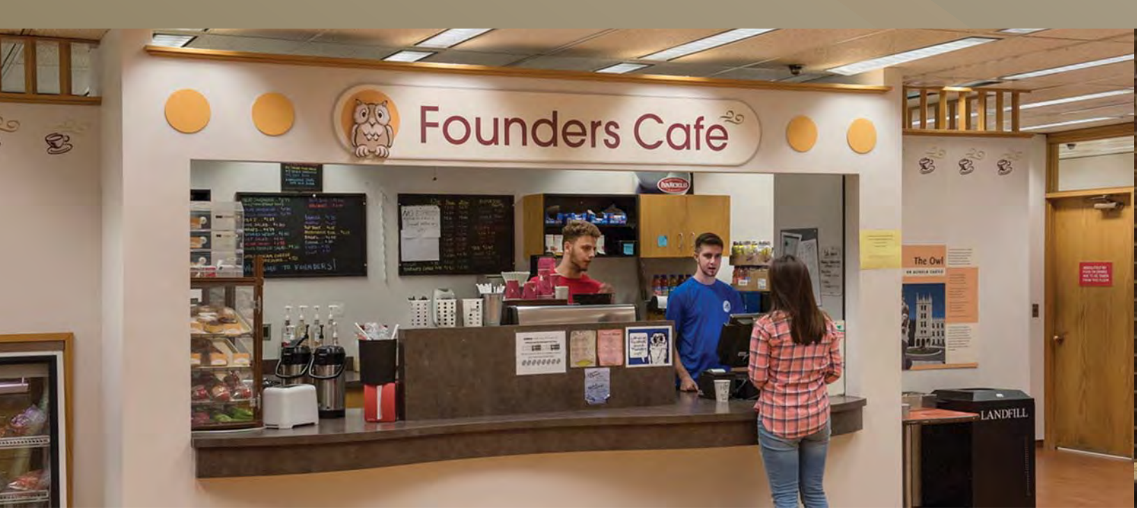
[continued from page 10]

While communication is important between and among these different resources in the library, much more should be considered. For example, there is the impact on the library space itself when these other offices and services move in. While Tijerino and Branham state that there are various articles that discuss the reorganization of library space, those articles tend to focus on using that space to encompass new features such as collaborative learning centers, information commons, and similar concepts—but there are very few sources that discuss this other loss of library space (14). And yet, this appropriation of space is quite common. A survey created by the authors found that 86.67% of respondents reported having non-library offices and services in their libraries (15). Such services run the gamut: cafés to computer labs to writing centers, to university services such as admissions, first year experience, and others. The authors attribute to this rise in the sharing of library spaces to factors such as the declining number of in-person library users over time while the number of Internet users has increased, that many colleges and universities are low on both space and finances, and that many libraries are typically located in the center of their campuses (14).