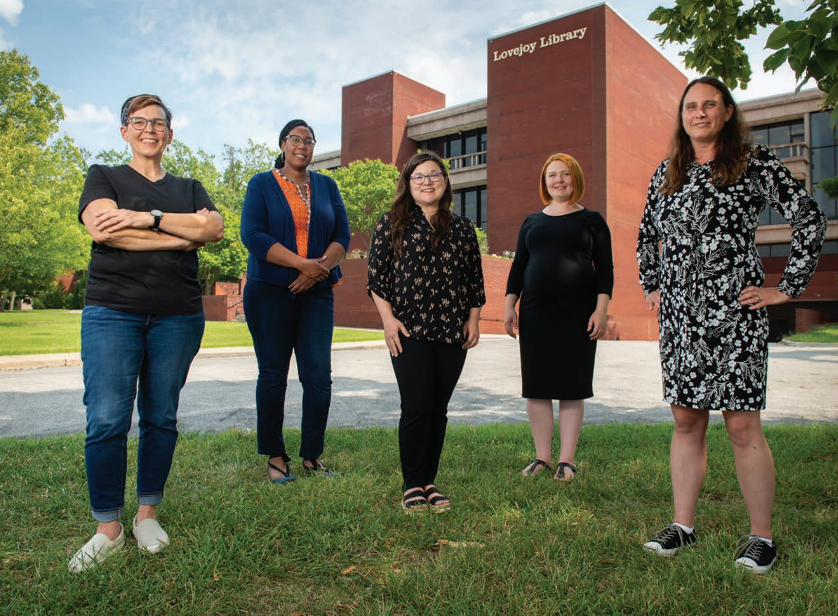
Southern Illinois University Edwardsville Marketing and Communications