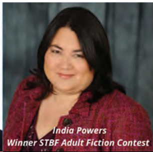
India Powers Winner STBF Adult Fiction Contest