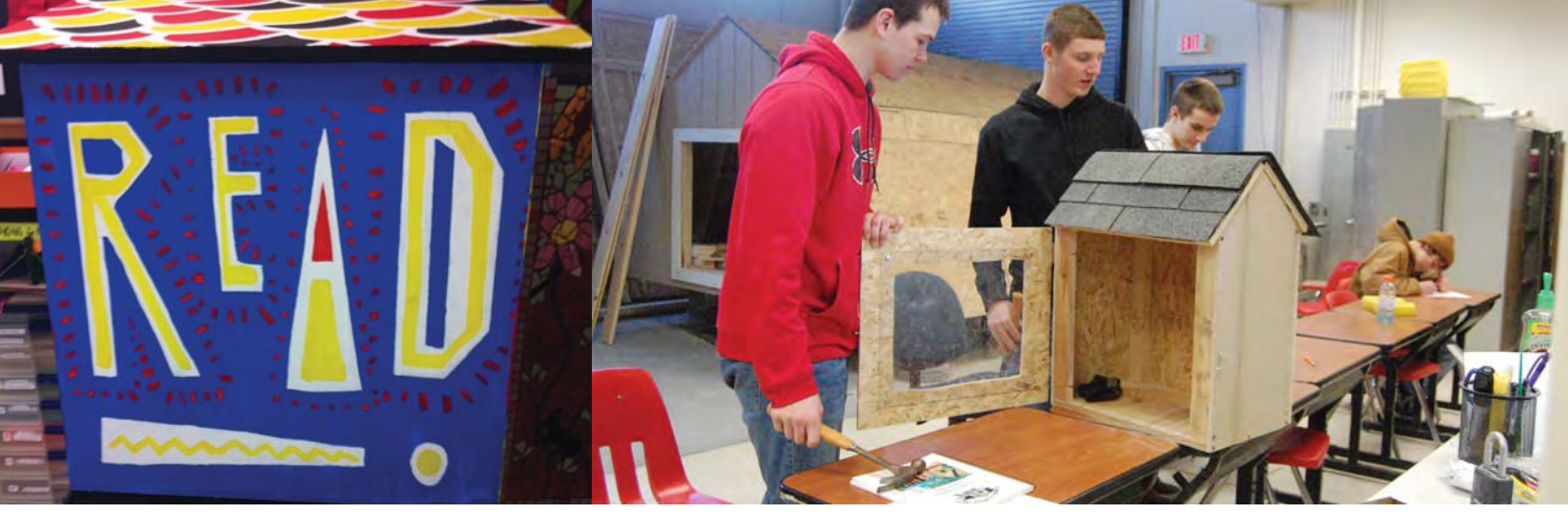
Baker Demonstration School's Little Free Library